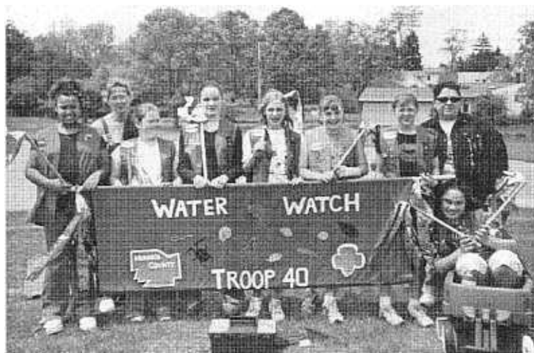
Troop 40 marched in the Henrietta Memorial Day parade.