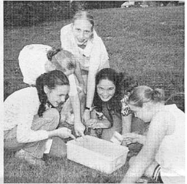
Girl Scouts in Troop 40 identify macroinvertebrates from Red Creek.

ing, and backyard conservation. It lists the requirements that Girl Scouts at each level must fulfill to earn the patch. There is a helpful glossary and a list of other resources. The information and activities would be interesting, not just to Girl Scouts, but to any children and to adults.