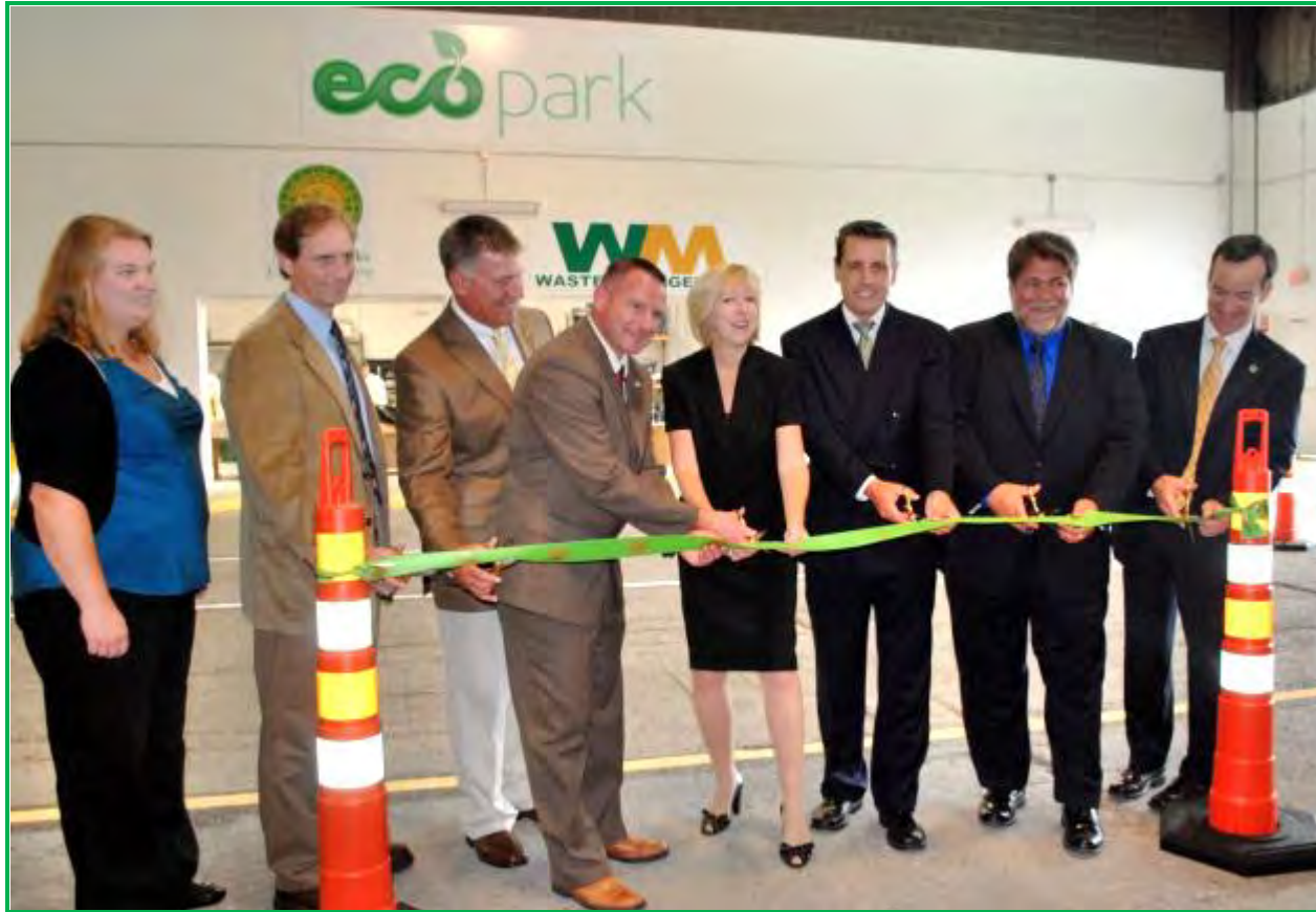
Ribbon cutting on 9/28/11