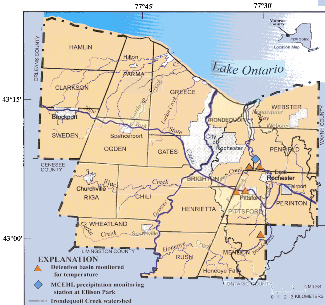
Base from U.S. Geological Survey, digital data, 1:100,000, 1983

Locations of detention basins monitored for temperature.