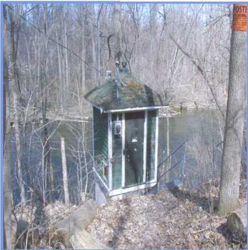
USGS streamflow-gaging station along Oatka Creek near Garbutt, NY. These sites are monitored as part of the flow-regulation system for the Mount Morris Dam on the Genesee River.

The thermal effects of discharges from "created wetlands" and nonvegetated detention basins require evaluation and comparison to define the effects of stormwater-detention basins on receiving-stream temperature.