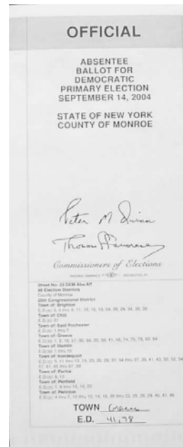
Front of affidavit ballot envelope