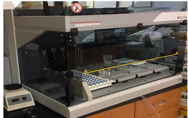
Health Department - Medical Examiner Program Summary Table

In a dynamic climate of newly available drugs and changing detection technology, the laboratory continuously evaluates instrumentation in order to remain abreast of current drug trends. New instrumentation better equips the laboratory for testing and ensures that the instrument can be properly maintained, and prevent weeks- or months-long downtime in the event the instrument goes down.