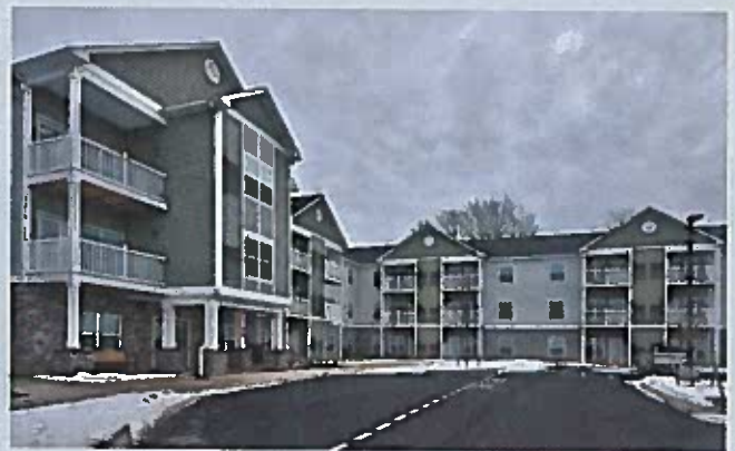
Heritage Gardens, Henrietta