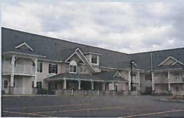
CDS Monarch II, Webster