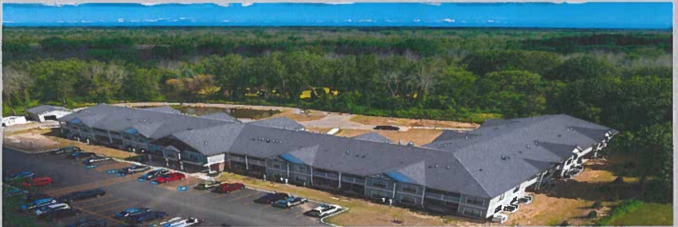
Wellington North, Brockport

Public Comment Period: May 4 - June 12, 2023