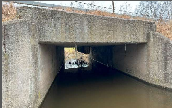
Town of Riga, Monroe County