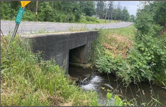
Town of Mendon, Monroe County