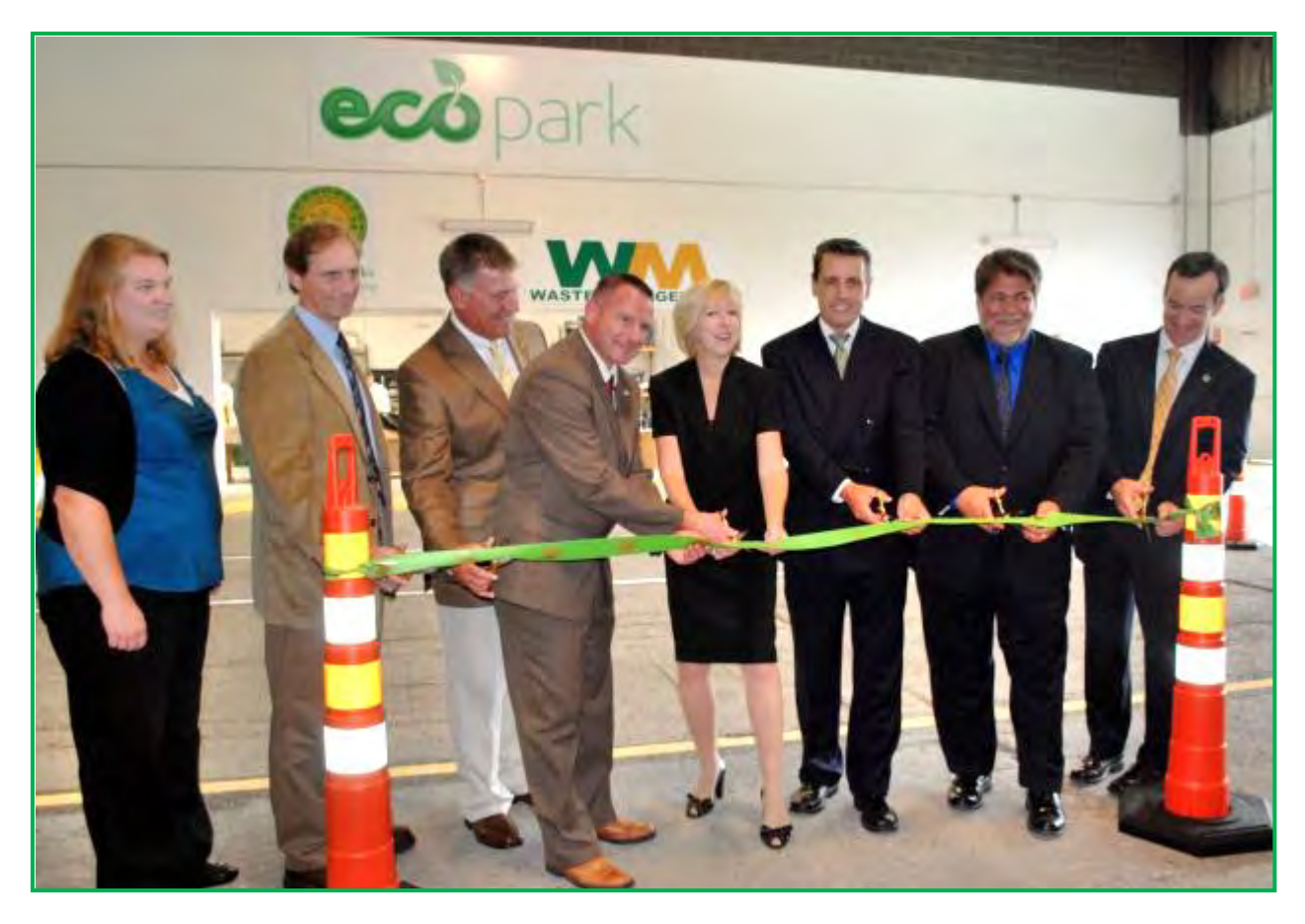
Ribbon cutting on 9/28/11