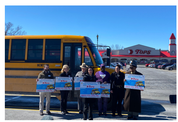
Easter Food Drive Announcement with TOPS Friendly Markets