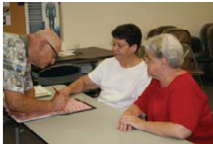
The Inspector Table

Sign in at the Inspector Table in your Election District as usual. An inspector will locate you in the poll ledger and have you