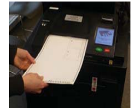
The voted ballot goes into the scanner slot

When you are finished filling out the ballot, review it to make sure you have voted for the candidates of your choice. Take your completed ballot to the ImageCast Optical Scanner. Place either end of the ballot into the scanner. If you don't have any errors on the ballot, it will be scanned and deposited in the locked ballot container. The scanner will tabulate the votes. If there is a need for a re-count, the ballots will be safely stored for further counting.