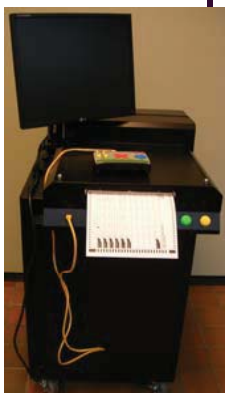
Ballot Marking Device (BMD)

When you sign in at the Inspector Table, you can request the assistance of the BMD. This feature is located on the end of the ImageCast ballot box, opposite the scanner. You will be given a blank sheet of ballot paper and a district code card (if multiple districts are using the machine) and directed to the BMD. An inspector will enter your district code into the BMD for your ballot and assist you with the headset, monitor, keypad, paddles, or sip & puff. When you are finished making your selections, the ballot will print out with your choices marked. This ballot is concealed in a privacy folder and placed in the scanner where you can once again verify your choices, and cast the ballot.