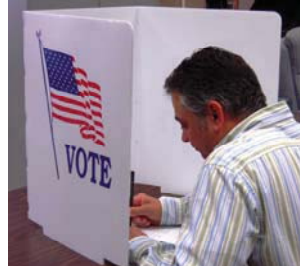
The Voting Booths

There will be privacy booths at every site; as well as a sit down privacy booth to accommodate a wheelchair. A magnifying sheet to assist in reading the ballot will also be available if needed.