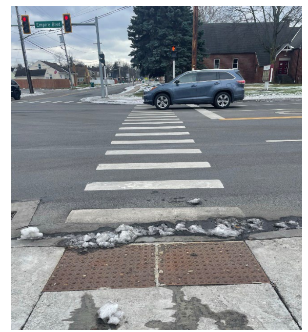
Crossing at Helendale Road