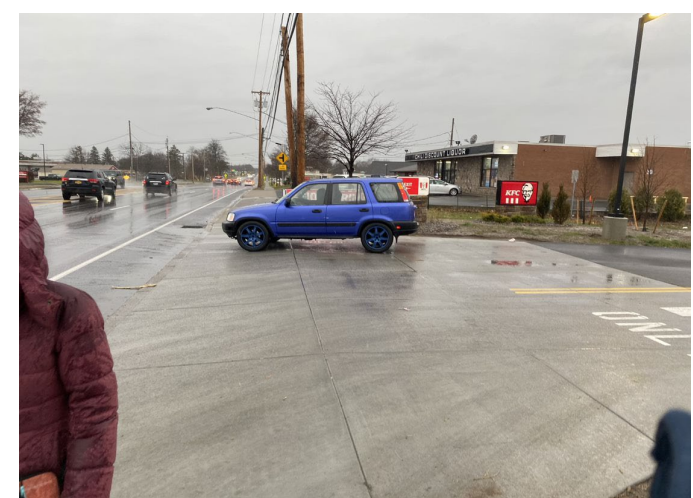
Concrete driveway with multiple access lanes