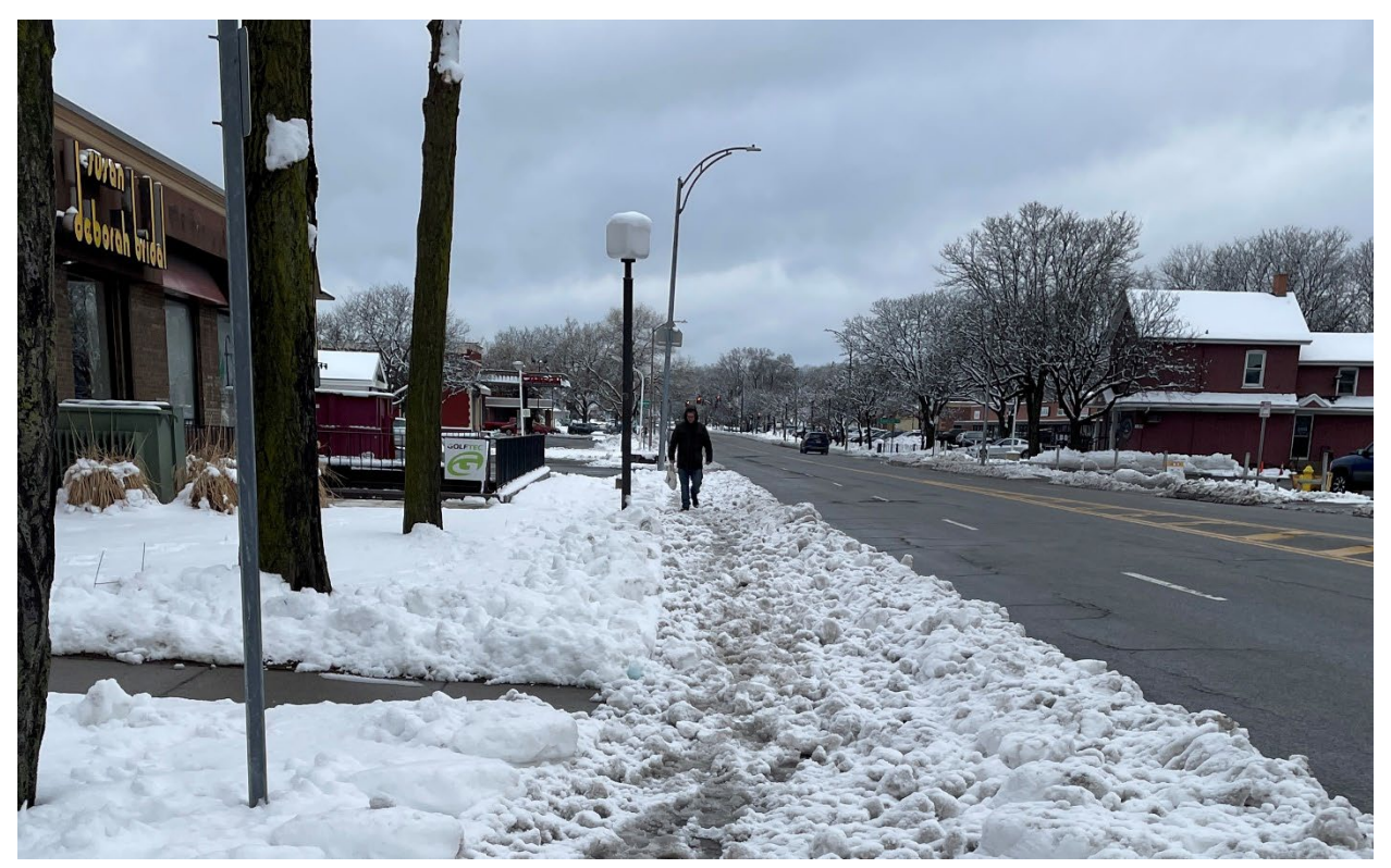
Unplowed sidewalk on the west side of Monroe Avenue north of Twelve Corners