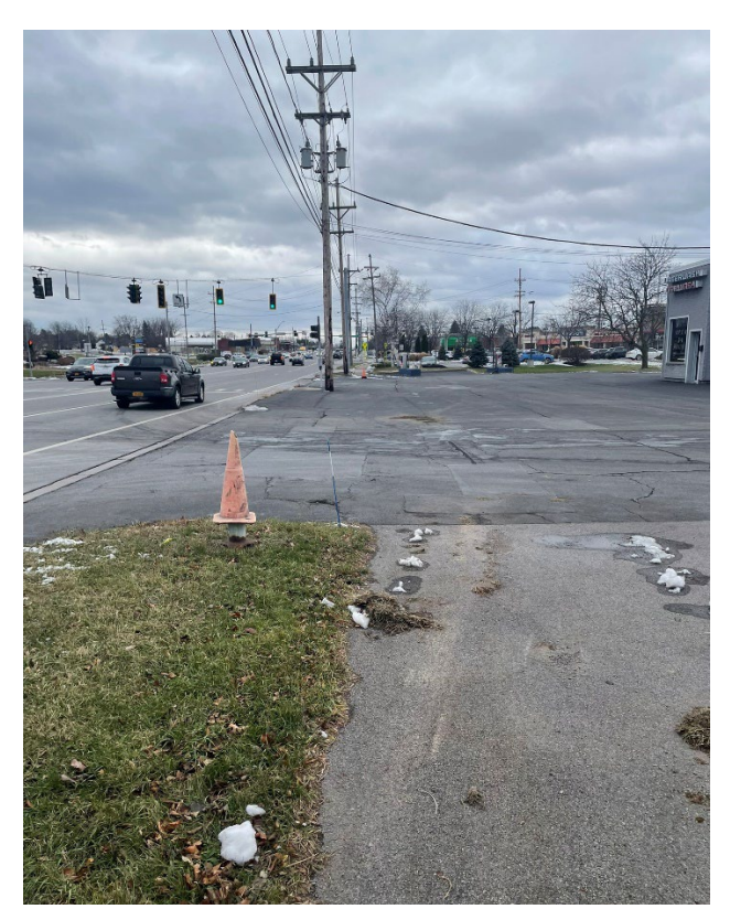
Laser Cash Car Wash – No sidewalks present