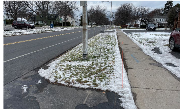
Tree Lawn on Winton Road with no street trees