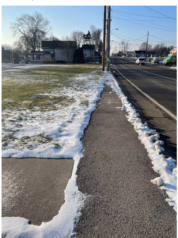
Asphalt path on east side of Gravel Road