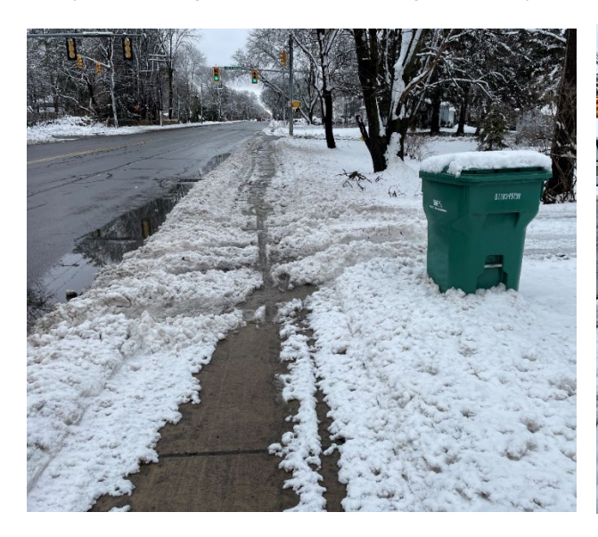
Residential Driveway on Elmwood east of Hollywood