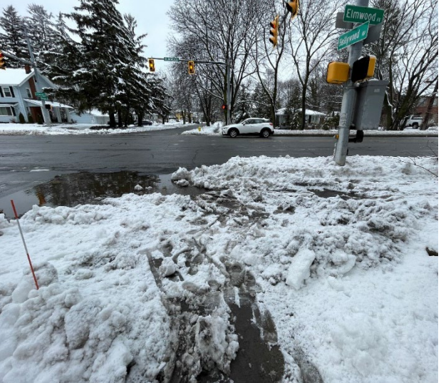
Elmwood & Hollywood Intersection