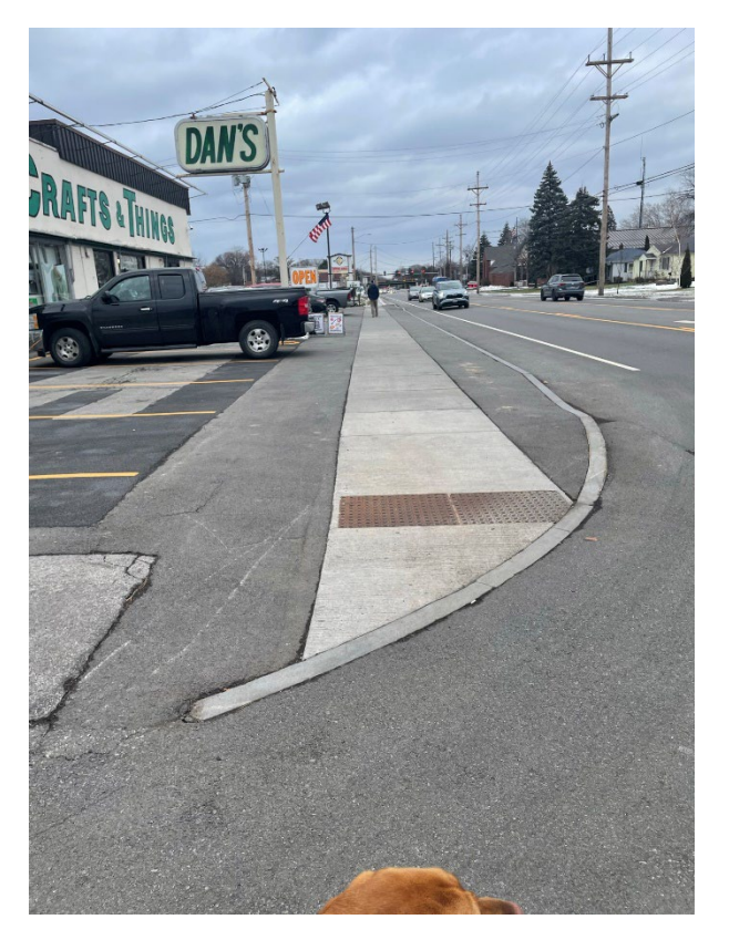
Dans Craft and Things Parking Area