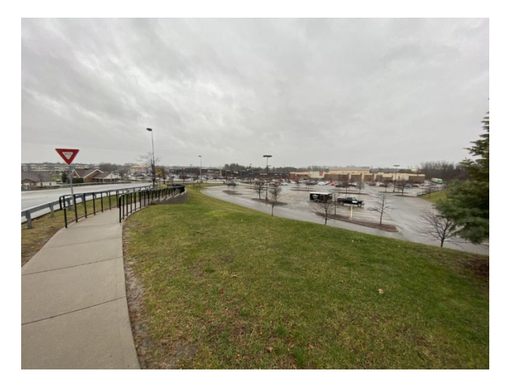
Sidewalk access within a private development