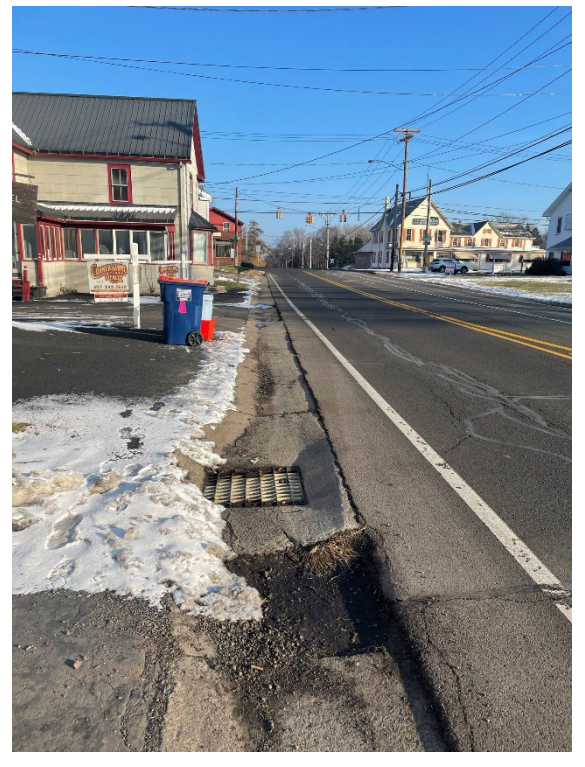
Shoulder on Gravel Road approaching Ridge Road