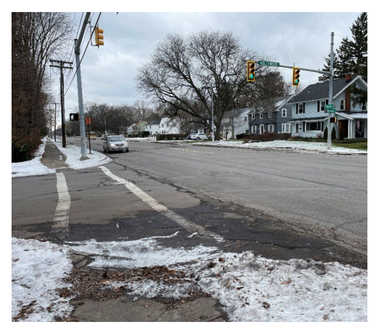
Elmwood Avenue and Hollywood Avenue Intersection