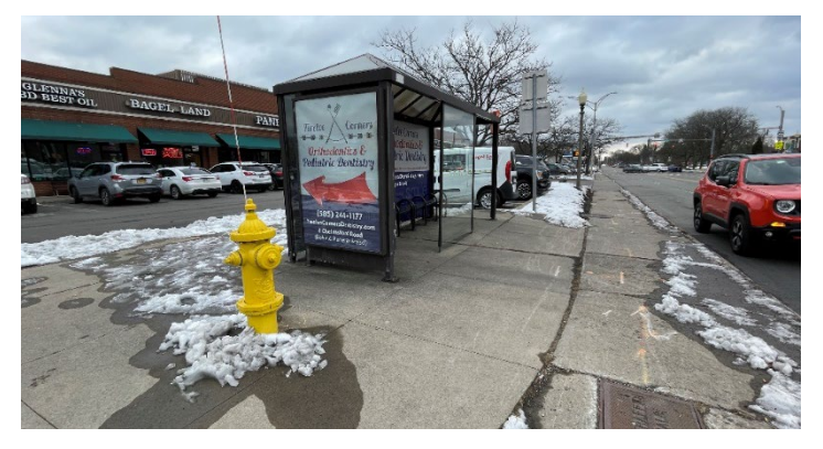
Bus Stop at Winton Road & Monroe Avenue