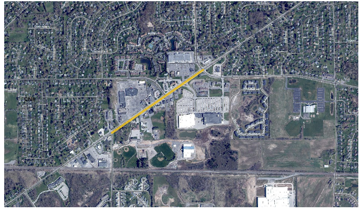
Chili Avenue Segment