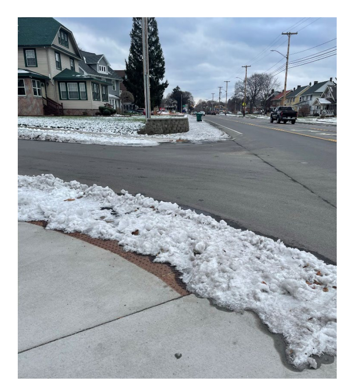
Residential street intersection