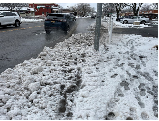
Unplowed Sidewalk on east side of Monroe north of Twelve Corners