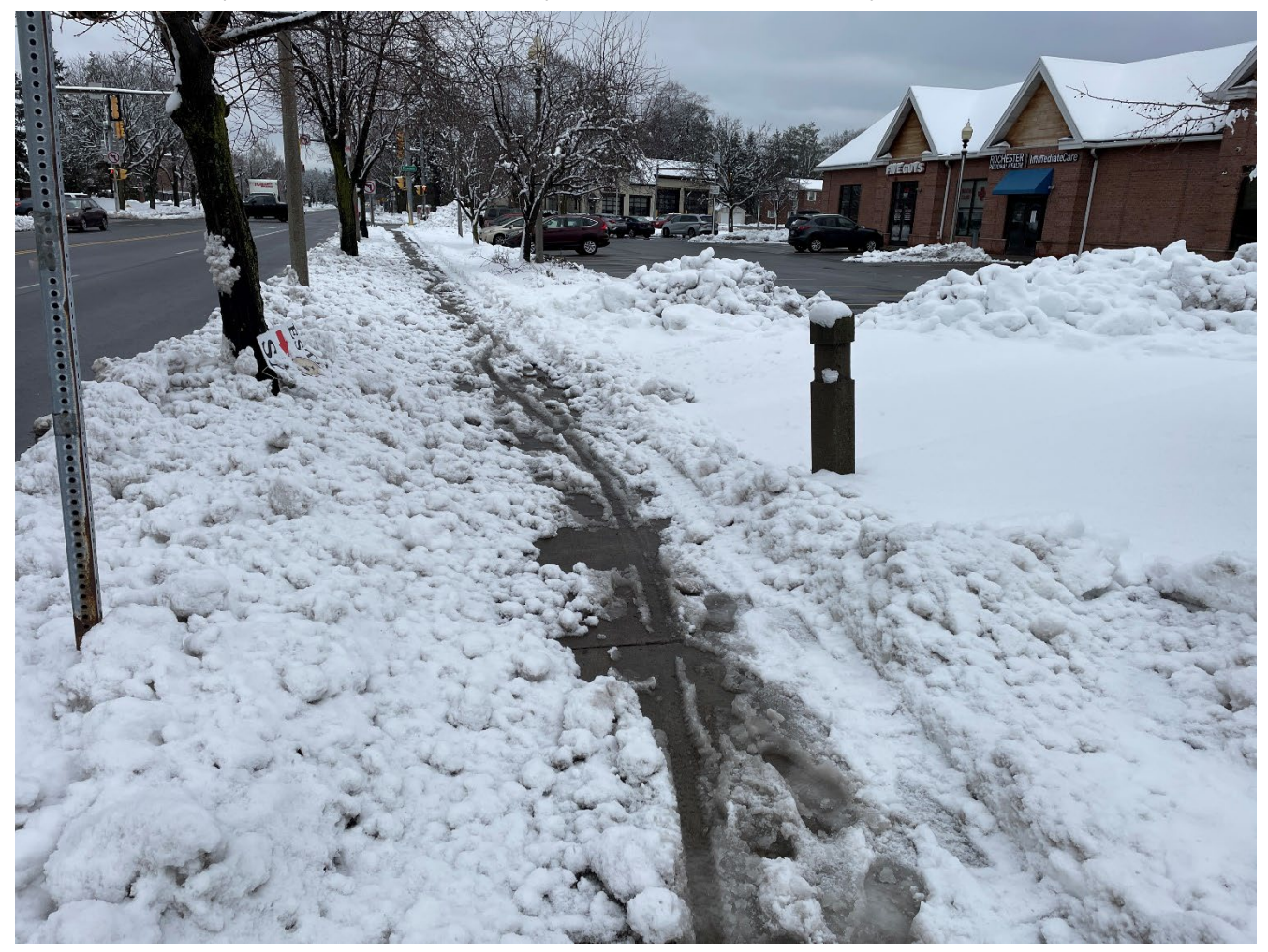
Partially cleared sidewalk on west side of Winton Avenue.