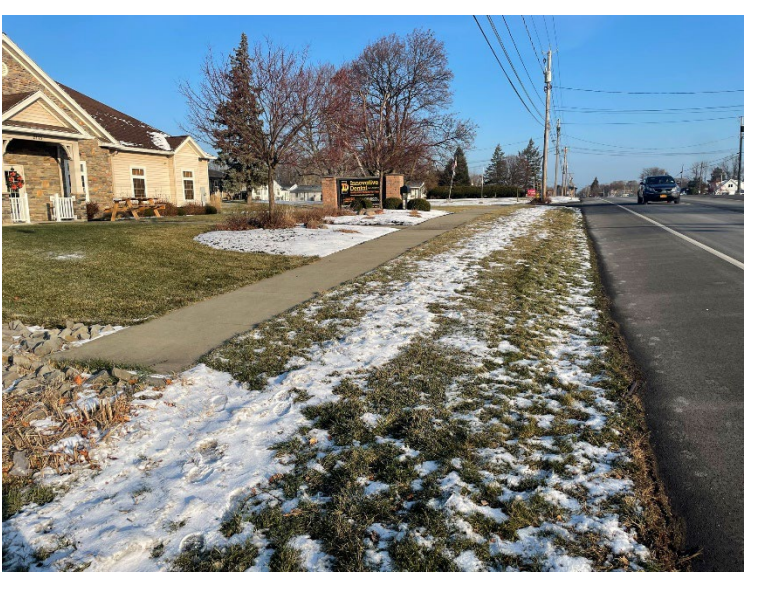
Sidewalk in front of Innovative Dental Health & Wellness