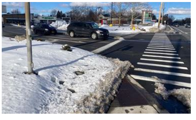
Snow clearing missed the curb ramp