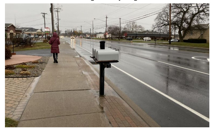
Sidewalk on South Side of Chili Avenue