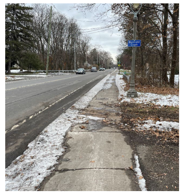
Sidewalk Surface Condition near Buckland Creek