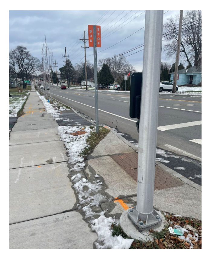
Bus Stop at Shelford Road is not ADA accessible.