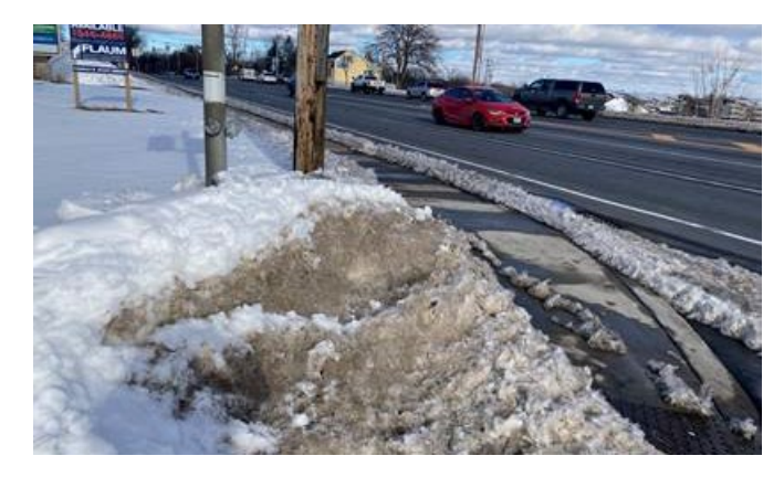
Snow block the access to the signal button and the curb ramp