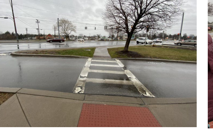
Crosswalk across slip lane to pedestrian island