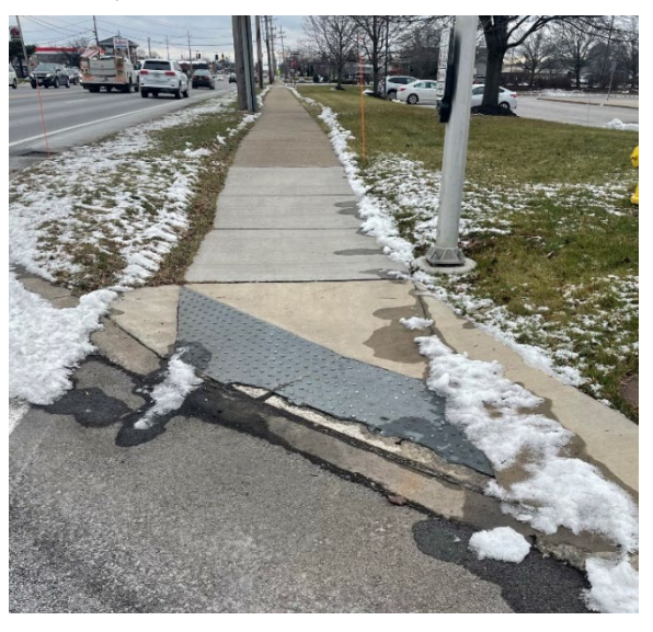
Detectable Warning Strip at the Wegmans Driveway