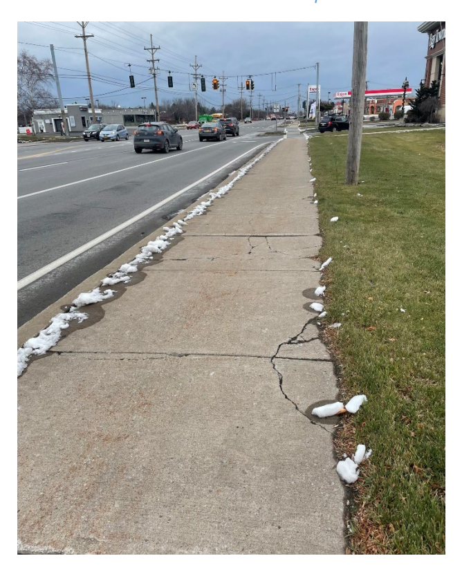
Some cracking on sidewalk