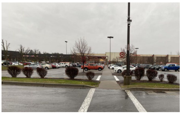
Pedestrian Access to a commercial area not along the roadway and path is within a private development