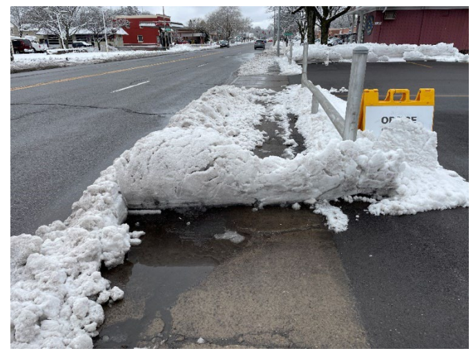
Plowed snow blocking sidewalk at Sunoco Gas Station