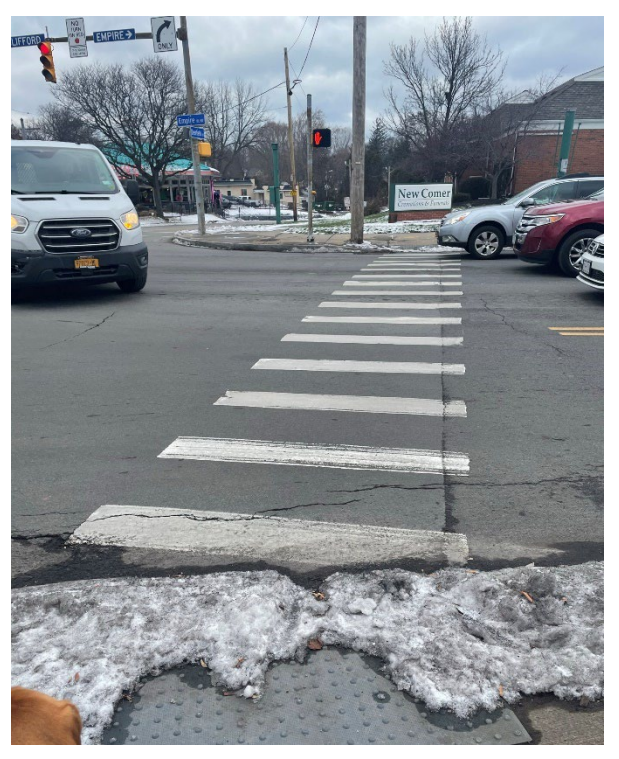
Intersection with Culver Road