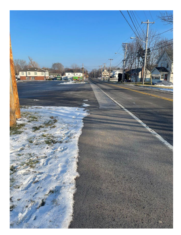
Driveway at the Fire Hall on Gravel Road