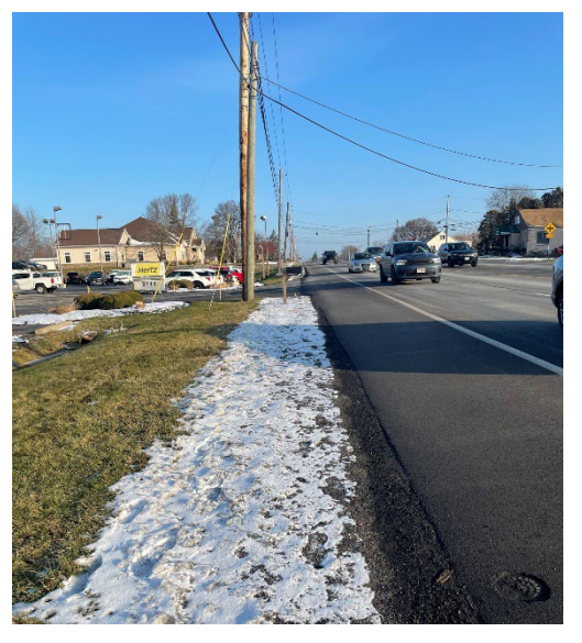
Shoulder on the west side of Empire