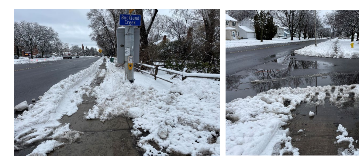
Partially cleared sidewalk at Buckland Creek

Snow obstructing sidewalk ramps at Penarrow Road