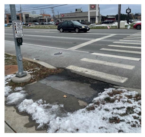
Crossing at Brandt Point Drive