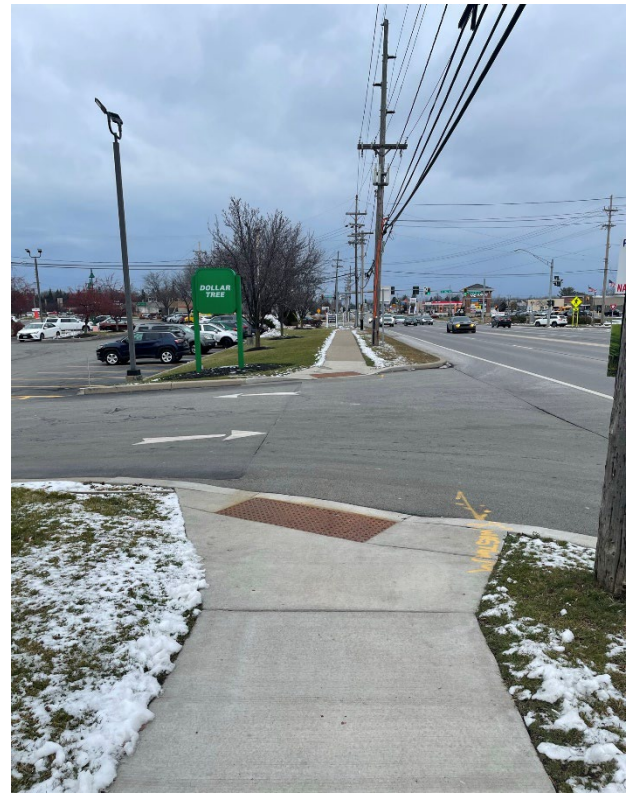
No crosswalk striping at Dollar Tree curb cut