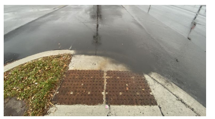
Pooling water at curb ramp