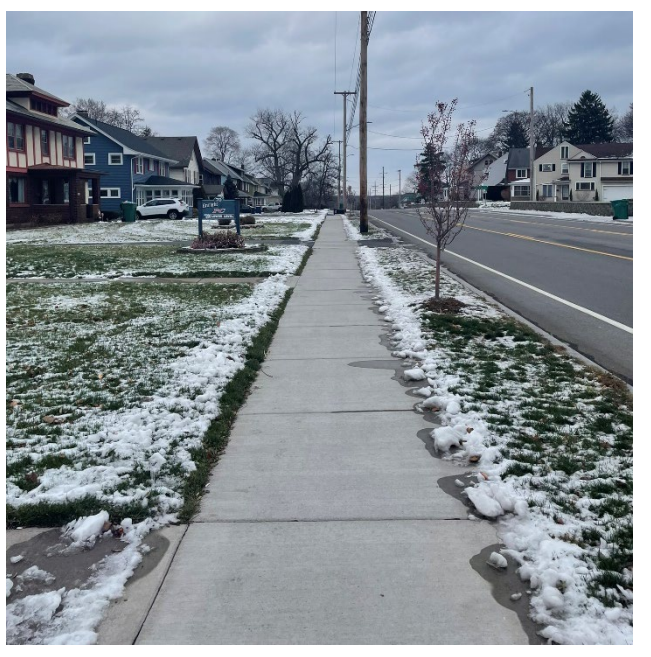
Excellent pavement condition and new street trees