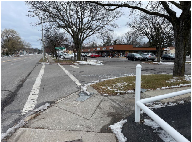
Sidewalk adjacent to roadway