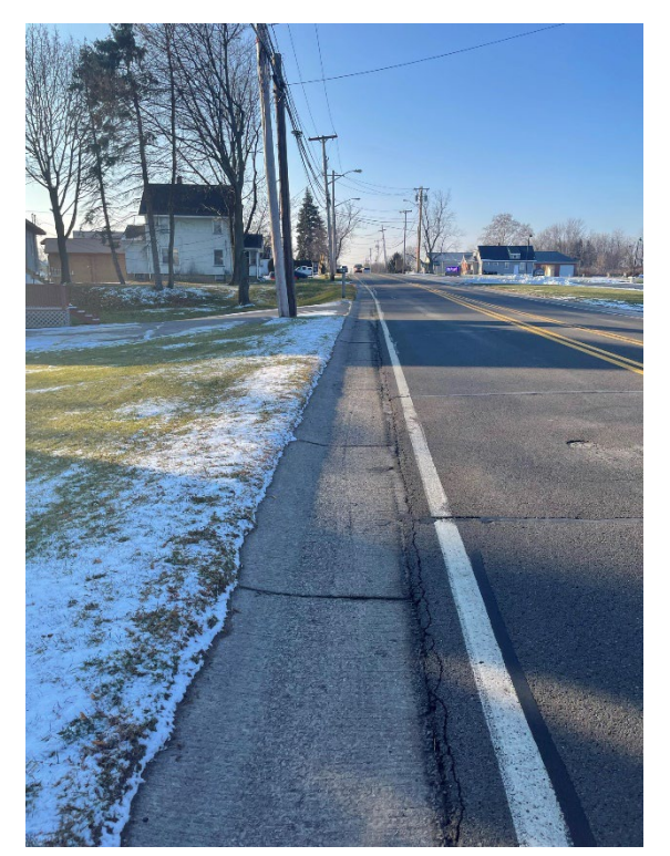
Shoulder on east side of Gravel Road