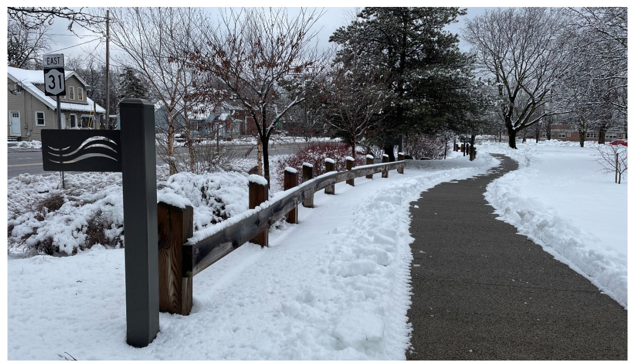
Clear permeable pavement on side path along Monroe Avenue at Twelve Corners Middle School

NOTE: Permeable concrete sidewalks, west side of Monroe at Middle School, are in very good condition and completely free of snow and standing water. Minimal or no salt was observed along this section of sidewalk.