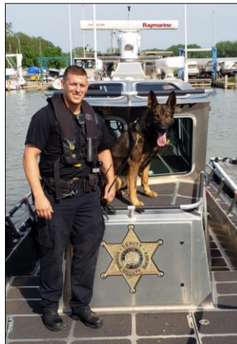
Deputy Priola K9 Sabre